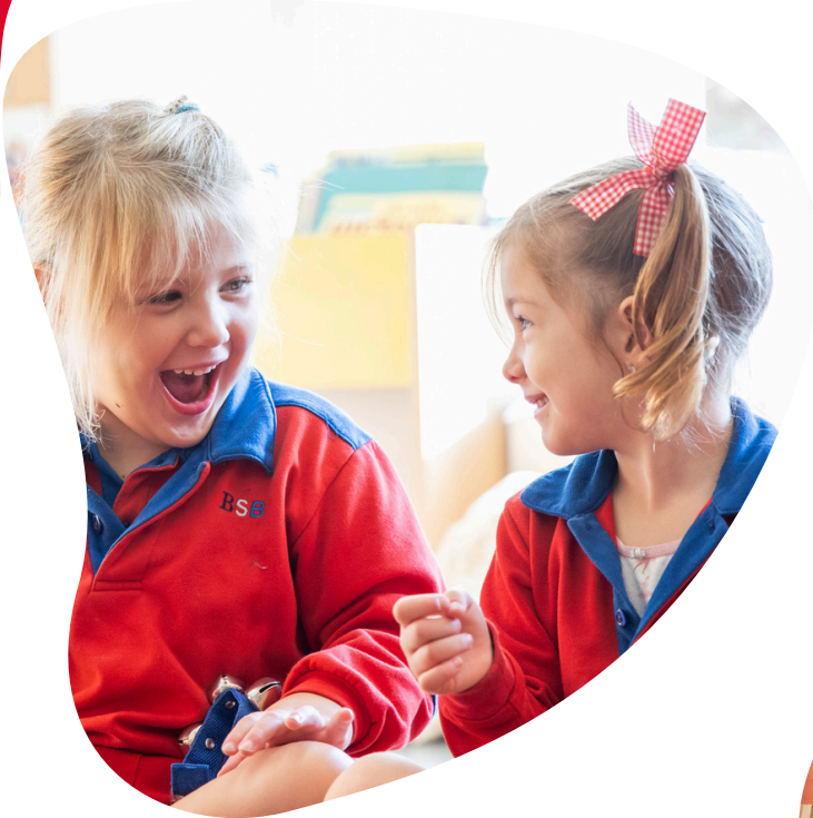
Start the day with a smile