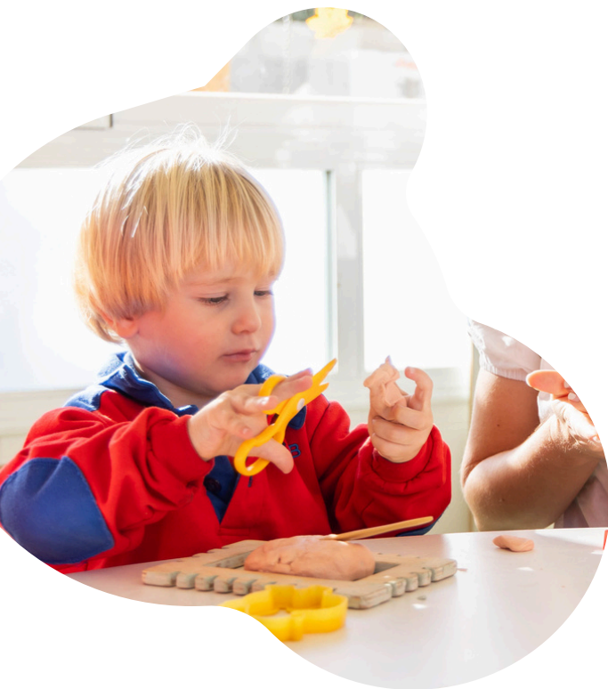
Limitless exploration and independent inquiry: making real world connections