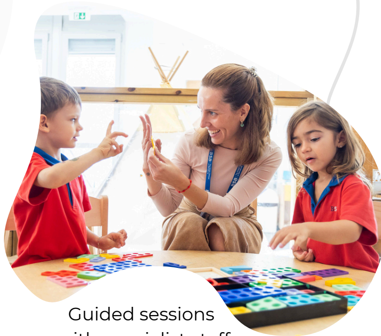
Guided sessions with specialist staff