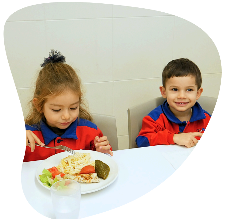
Shared mealtimes: a community experience