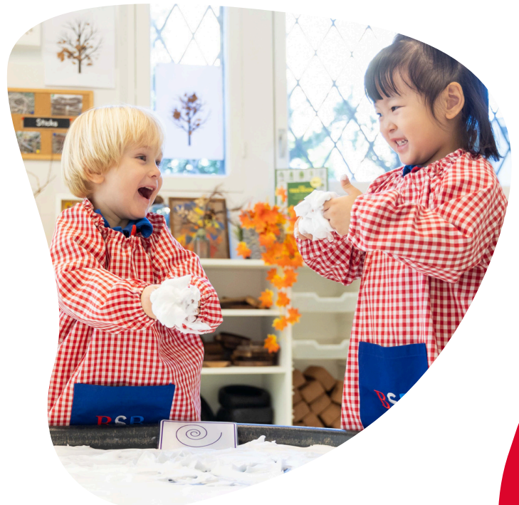
Collaborative experiences and fostering relationships