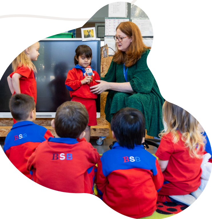
Storytime and imaginative play