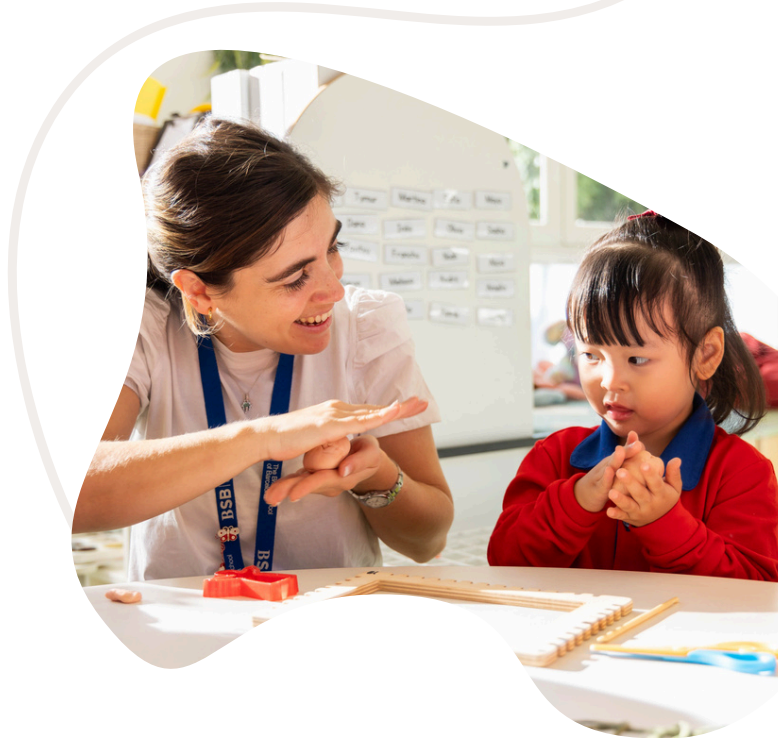
Learning through playful curiosity